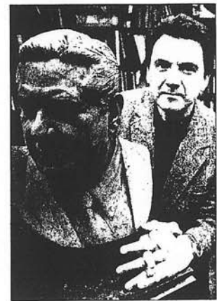
Sculptor Zenos Frudakis spent five years completing a 10-foot statue of Former Philadelphia Mayor Frank Rizzo.