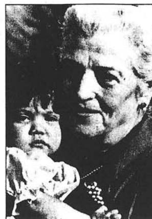
Pearl S. Buck (left) wrote "The Good Earth" and more than 80 other books. At her Hilltown home she started Welcome House, which found homes for children of Asian-American parentage who were considered unadoptable.