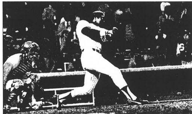
Baseball great Reggie Jackson is a 1964 graduate of Cheltenham High School, where he was said to be better at football than baseball. He hit 563 home runs.